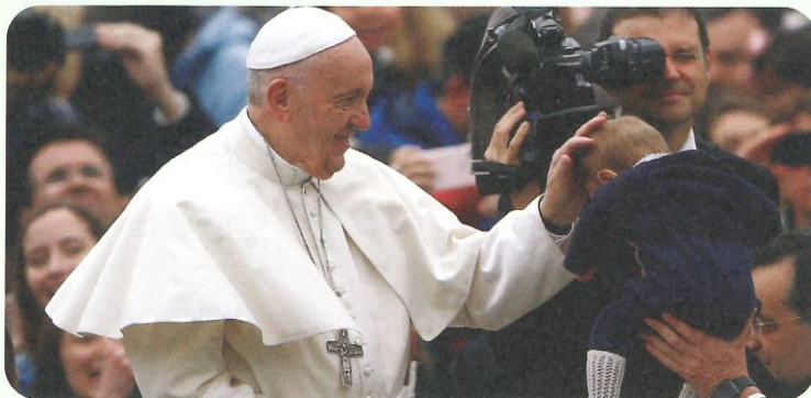
CATHOLIC NEWS SERVICE