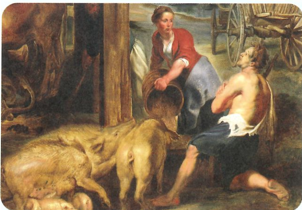
THE PRODIGAL SON, PETER PAUL RUBENS