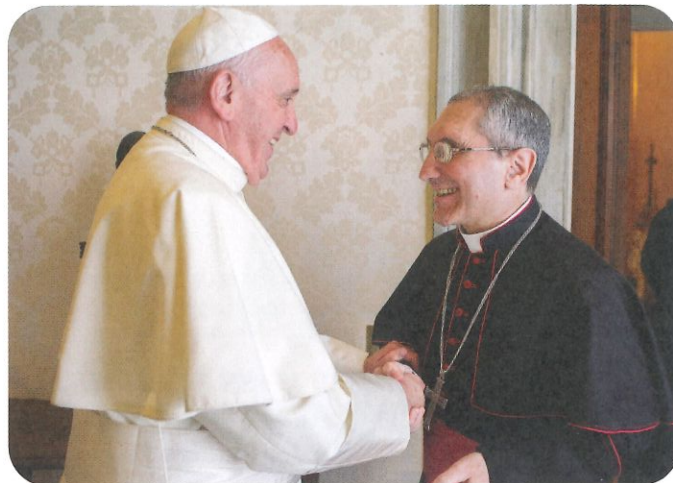
VATICAN/CATHOLIC NEWS AGENCY

The differences between these bishops are the tasks they perform and the authority they have within a diocese. However, as bishops, they all receive the same ordination. ●