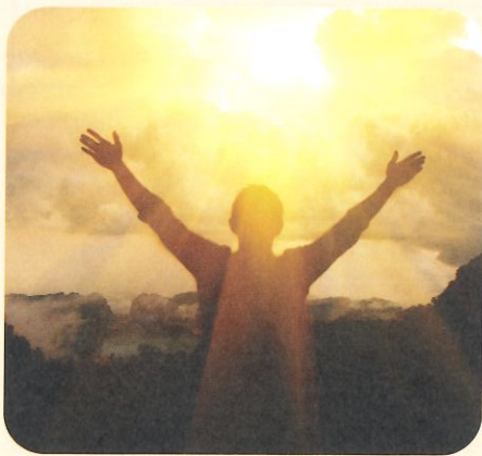
DEER WORAWUT / SHUTTERSTOCK