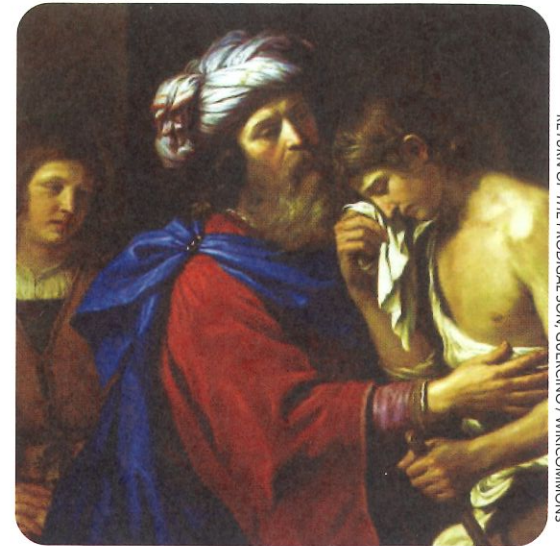
RETURN OF THE PRODIGAL SON, GUERCINO