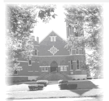
614 North Defiance Street Archbold, OH