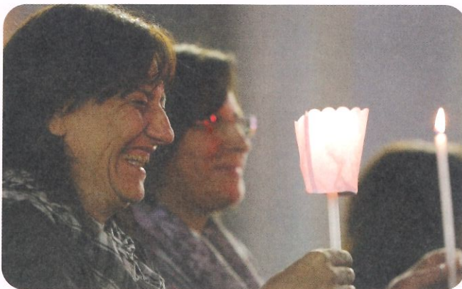
CATHOLIC NEWS AGENCY