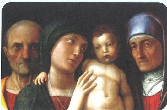
HOLY FAMILY WITH SAINTS ANNE AND JOHN THE BAPTIST (DETAIL), ANDREA MANTEGNA