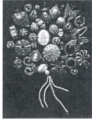
Sample of shadow box

The Altar Rosary will be assembling a Shadow box with old jewelry from our parishioners. If you would like to donate a piece or pieces to be included in the display or need additional information, please see Anita Van Zile.