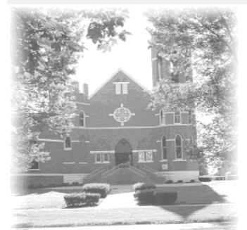
614 North Defiance Street Archbold, OH