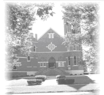
614 North Defiance Street Archbold, OH